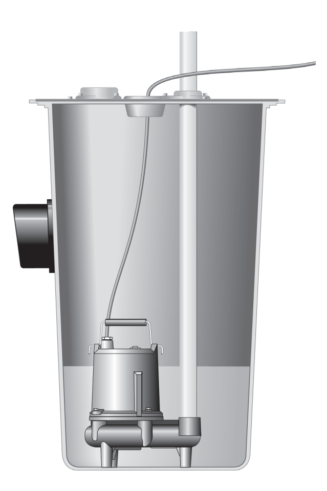
Figure 1: SKV50 Typical Installation

A WARNING Do not pump flammable liquids, strong chemicals or salt water.