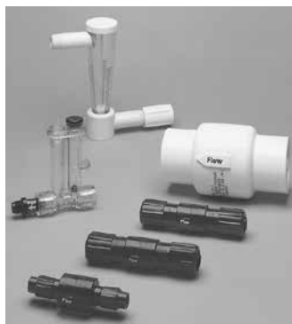
In-line Check Valves & Flow Indicators