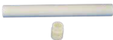
DekClor Start Up Kit