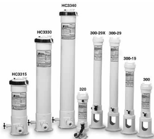
Pentair Chlorine and Bromine Feeders