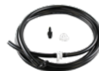
Ozone Injector Manifold Tubing Kit with Check Valve