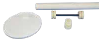
DekClor Start Up Kit with Safety Plate