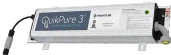
QuikPure3 25,000 Gallon (Stand Pipe)

Pentair's QuikPure3 reduces cleaning maintenance resulting in reduced harsh chlorine smell, red eyes and itchy skin.*