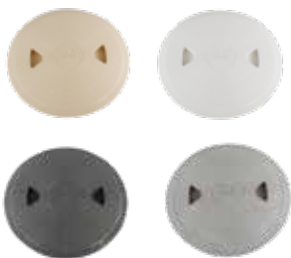
DekClor Lid White, Tan, Dark Gray, & Light Gray