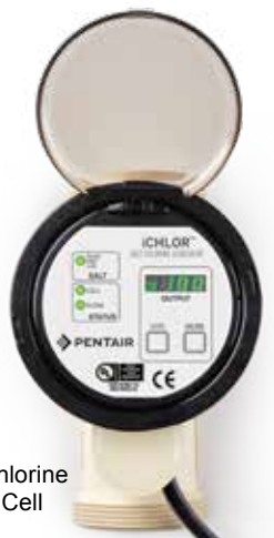
iChlor Salt Chlorine Generator Cell