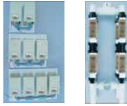
Possible Power Center and Manifold Configurations

IntelliChlor Salt Chlorine Generator uses common table salt to produce all the chlorine a pool needs, effectively, and automatically.