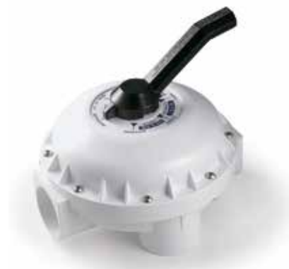
HiFlow Valve 261049