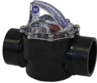
FlowVis (US Gallon Per Minute)