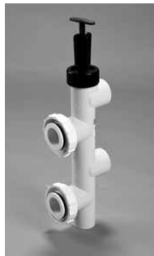
PVC Slide Valve Kit 263064