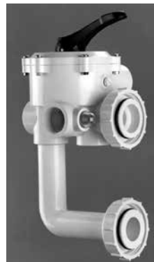
Multiport Valve Kit 261055