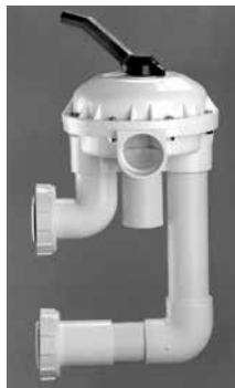
HiFlow Valve Kit 261050